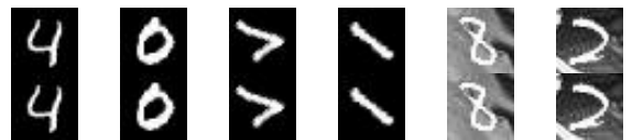
Table 3: The original (the top row) and successfully perturbed (the bottom row) images.

We proposed an exact Boolean encoding of binarized neural networks that allows us to verify interesting properties of these networks such as robustness and equivalence. We further proposed a counterexample-guided search procedure that leverages the modular structure of the underlying network to speed-up the property verification. Our experiments demonstrated feasibility of our approach on the MNIST and its variant datasets. Our future work will focus on improving the scalability of the proposed approach to enable property verification of even larger neural networks by exploiting the structure of the formula. Another interesting direction is to verify properties of recurrent neural networks that have a number of additional structural properties, e.g., repetitive blocks of layers, that can be exploited during reformulation and search.